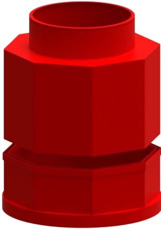
Product Shown B421-48-S-00