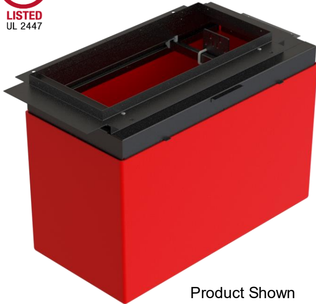
Product Shown B8380-S30