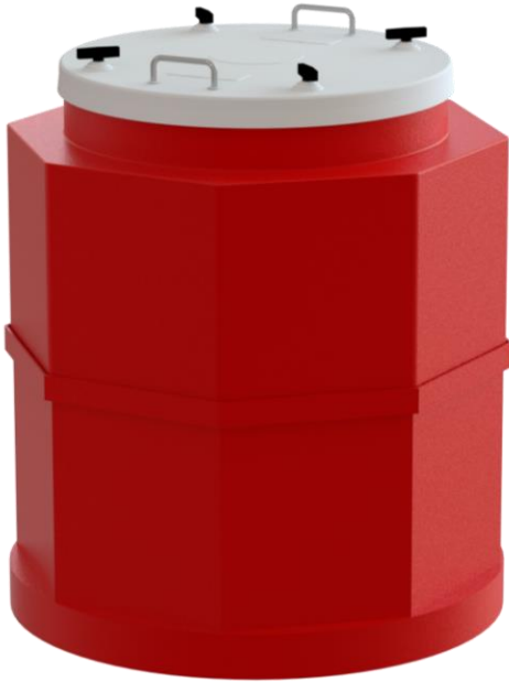
Product Shown B421-60-S-01