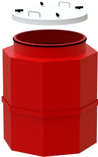
Product Shown B423-60-S-01