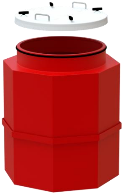
Product Shown B422-60-S-01