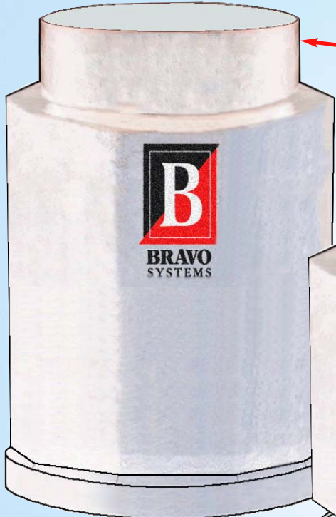
B400 Solid Sump