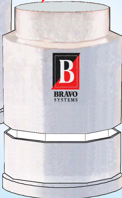
B401 Split Sump

B400 and B401 Octagonal Sumps are Available with 32" or 36" Top Hat Reducers.