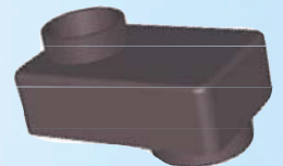
MO-400 1-1/2" Offset MO-401 1" Offset MO-402 2" Offset MO-403 3" Offset