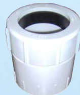
VFA-3 3" Vent Riser Fitting