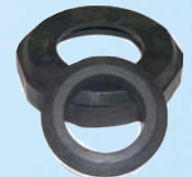
B-18-2-C-1-1/2G-10PKG 2" Compression Nut w/ Gasket - 10 Pack