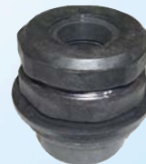
B-18-3 1-1/2NEW 3" Hose Termination (1996 to Present)