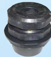
B-18-3 1-1/2LN 3" Hose Termination (1992 to 1996 Only)