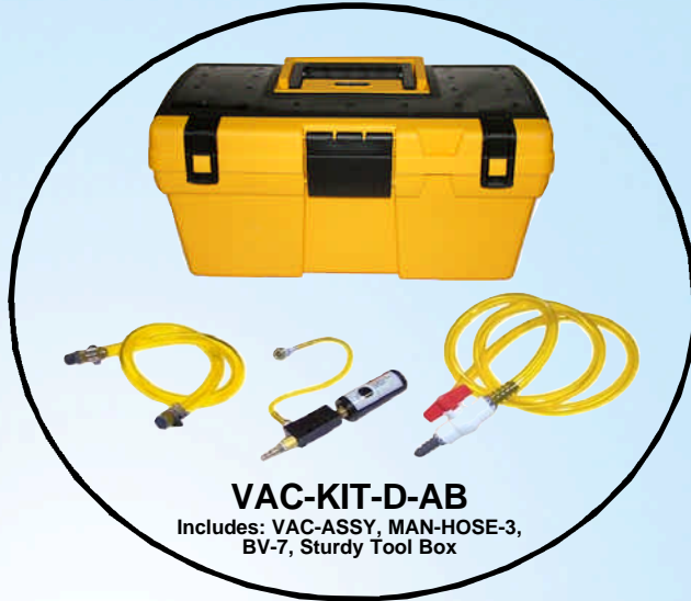
VAC-KIT-D-AB Includes: VAC-ASSY, MAN-HOSE-3, BV-7, Sturdy Tool Box