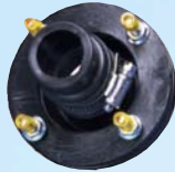
B17 3/4" & 1" Flexible Electrical Penetration (SingleWall)