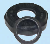
B-18-1-1/2-CG-10PKG 1-1/2" Compression Nut w/ Gasket - 10 Pack