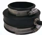
BR-3x2-T 3" to 2" Reducer with Tester