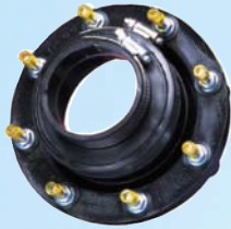
B33 3" Flexible Product Penetration (SingleWall)