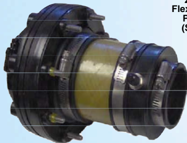
B-33-D-BR-3x2-T 3" Double Ended Fitting with 3" to 2" Reducer with Tester