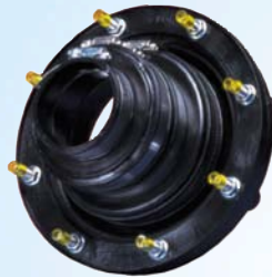
B34 2", 3" & 4" Flexible Product Penetration (SingleWall)