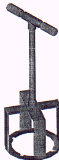
Bravo BT-70 Tool