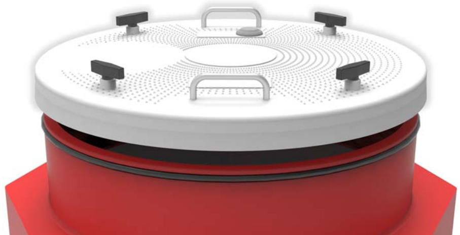
SNAP-LOCK Cover (SL32)

You can also see a video at: sbravo.com/videos