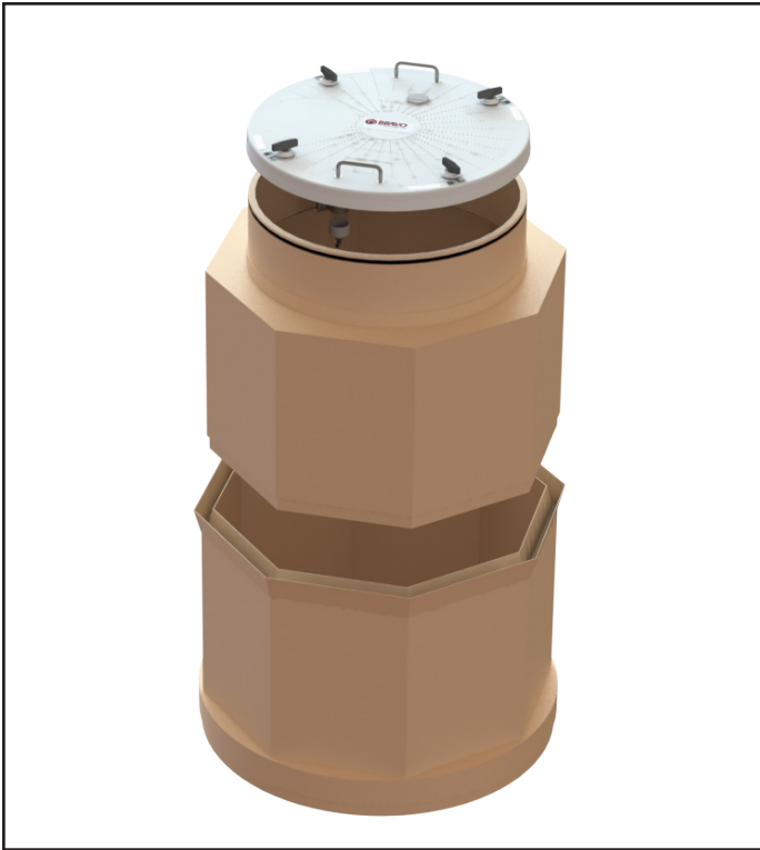
Part #: B481x36-(35T+30B)-DB-XT

The Tank Sump Collar Mount Doublewall VPH with the octagon shape provides the greatest access to pipe at 45- and 90-degree angles. It features a snap-lock lid with vertical o-ring seals to make it water-tight. It comes with a 30-year corrosion warranty. There is a v-groove pour channel to join the two-piece containment sump eliminating the need for lamination. The pour channel allows communication between the base and the top hat. The collar mount can be ordered to match the tank manufacturer's collar providing easier lamination in the field.