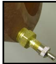
Optional: Secondary Test Port